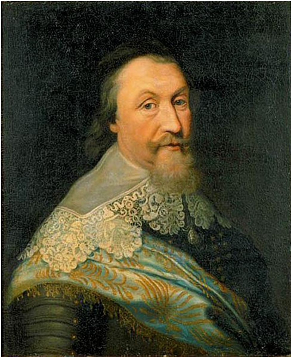
Axel Oxenstierna (1583 – 1654)